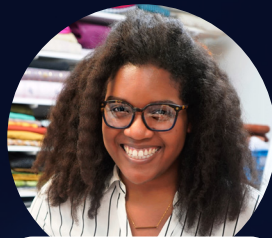
Catherine Bell Sew Simple Sewing