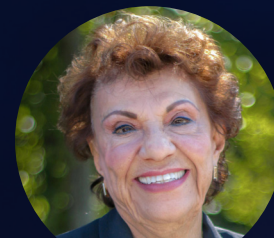
Clara Reyes Dos Mundos Newspaper