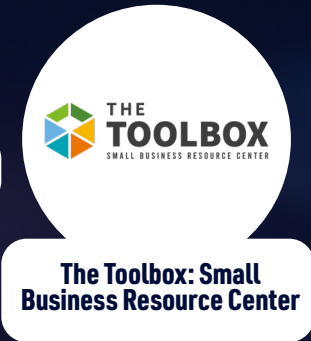
The Toolbox: Small Business Resource Center