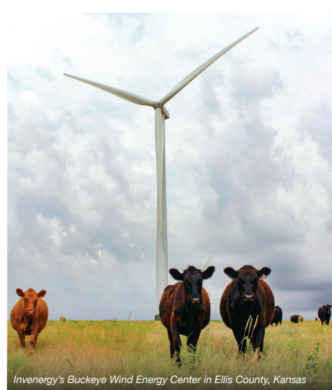
Invenergy's Buckeye Wind Energy Center in Ellis County, Kansas