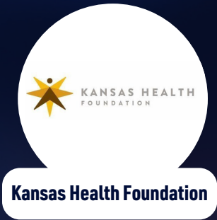
Kansas Health Foundation

The top three finalists for the 2024 Governor's Award of Excellence are: